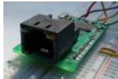
Netzer on a prototyping board.