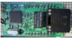
Netzer from top.