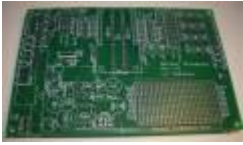
Netzer breakout board - The first PCB