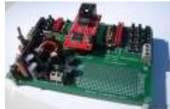
Netzer breakout board - Assembled with parts and Netzer