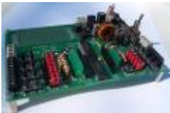
Netzer breakout board - Assembled